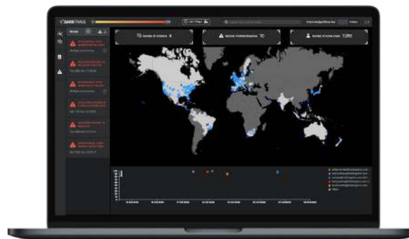
Figure 2: The Darktrace Immune System ensures your dynamic workforce is always protected.